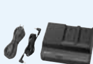
BC-U2 Battery Charger (2-slot)