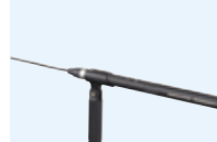
ECM-680S Stereo Microphone