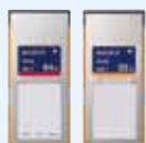
SBS-64G1A/SBS-32G1A SxS-1 Memory Card