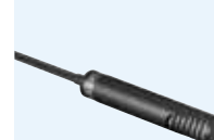
ECM-MS2 Stereo Microphone