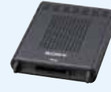
SBAC-US10 SxS Memory USB Reader/ Writer