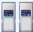
SBP-64A/32 SxS Pro Memory Card