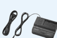
BC-U1 Battery Charger (1-slot)