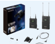
UWP-V1/V2 Wireless Microphone System